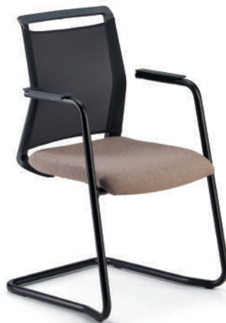
NUR OPERATIVE CHAIR