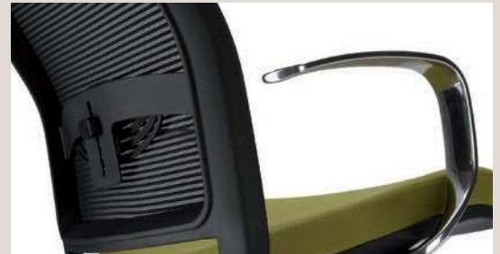
Poggiareni regolabile. Adjustable lumbar support.