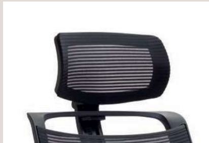
Poggiatesta regolabile in altezza rete. Height adjustable headrest mesh.