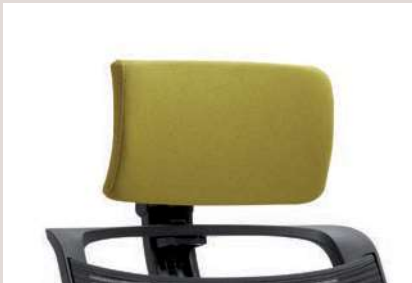
Poggiatesta regolabile in altezza imbottito. Height adjustable headrest padding.