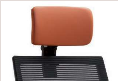
Poggiatesta regolabile in altezza imbottito. Height adjustable headrest padding.