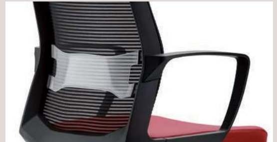
Poggiareni regolabile. Adjustable lumbar support.