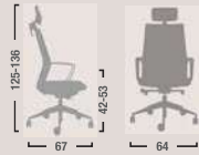
DU101/DU201 Poltrona presidenziale con braccioli e oscillante mov.27 tilting. Presidential armchair with mov.27 tilting.