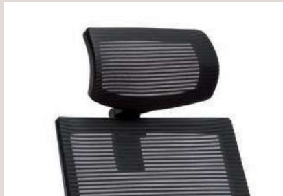
Poggiatesta regolabile in altezza rete. Height adjustable headrest mesh.