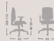
LP13-LP23 Sedia dattilo ergonomica con braccioli mov. 4. Low ergonomic armchair mov. 4.