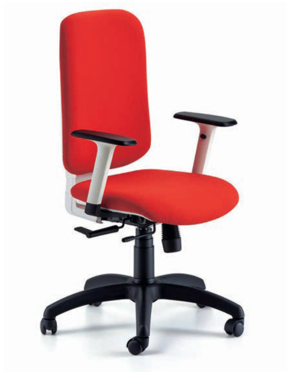
LOOP BIANCA OPERATIVE CHAIR