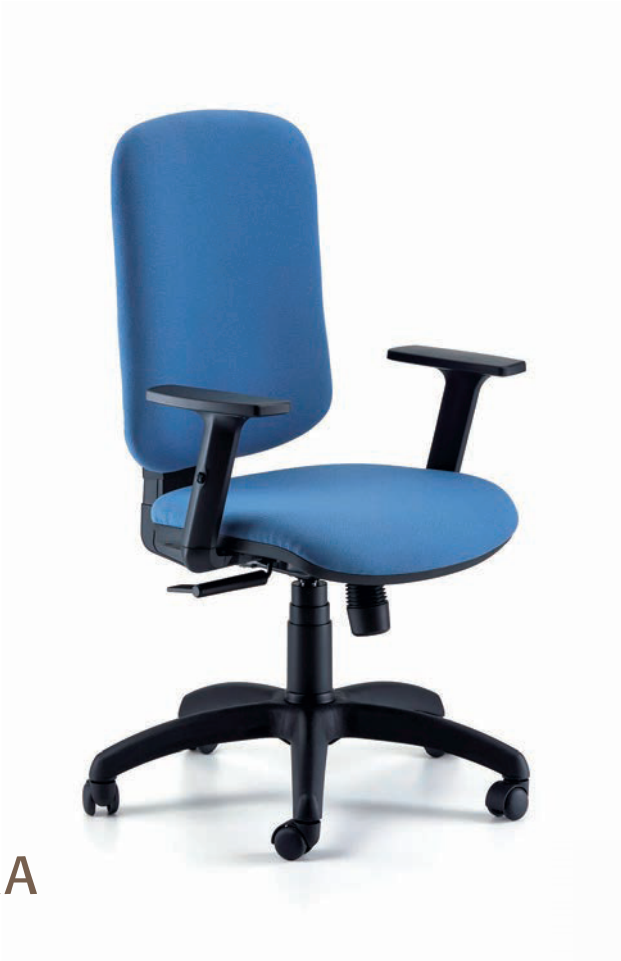
LOOP NERA OPERATIVE CHAIR