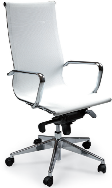
KIRA net EXECUTIVE CHAIR