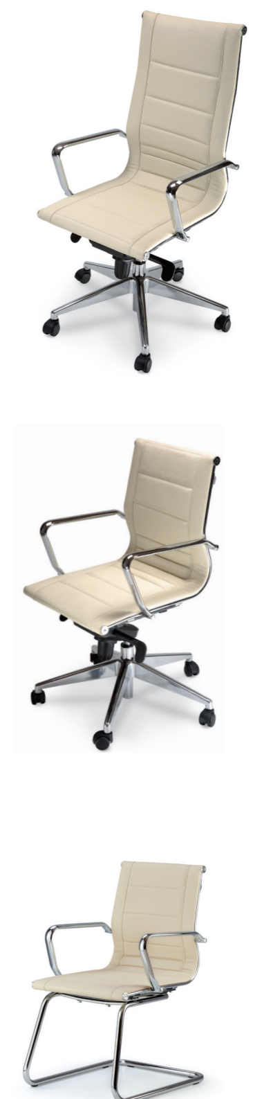
KIRA EXECUTIVE CHAIR