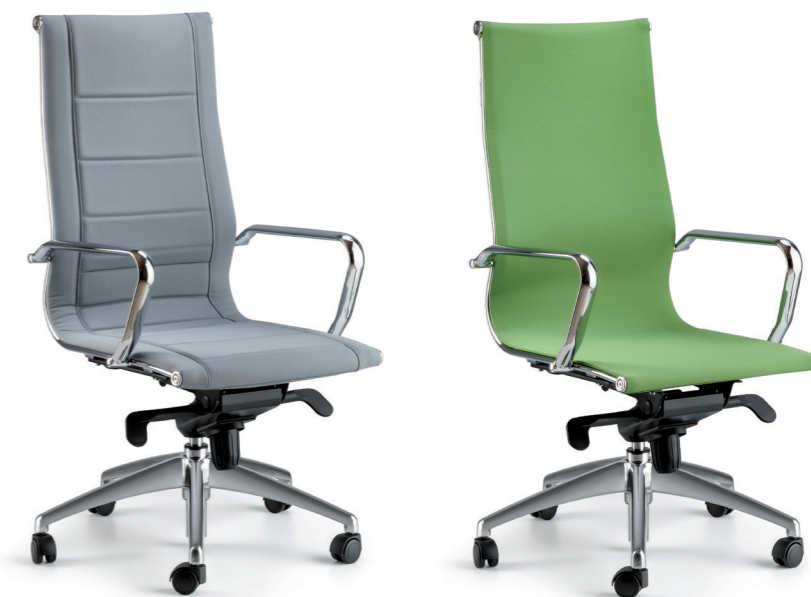
KIRA EXECUTIVE CHAIR