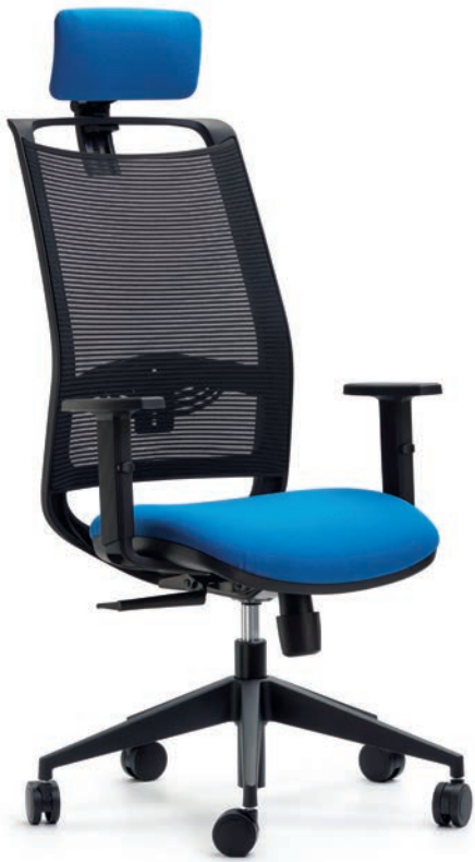
GIULIA 100 EXECUTIVE CHAIR