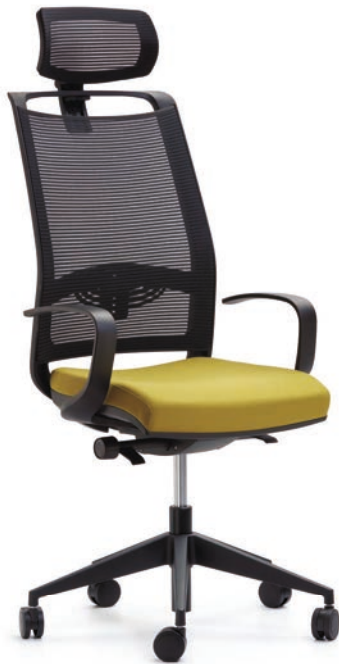
GIULIA 200 EXECUTIVE CHAIR