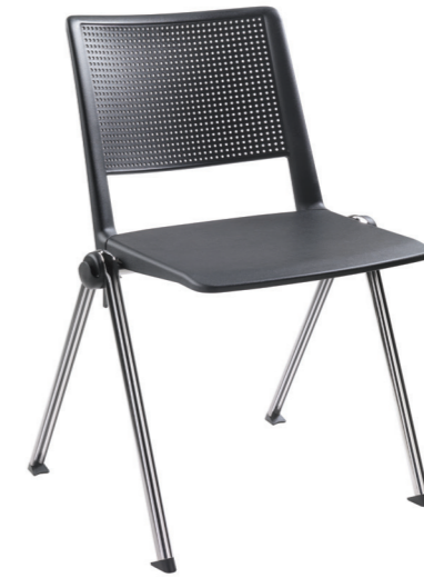
FREE COMMUNITY CHAIR