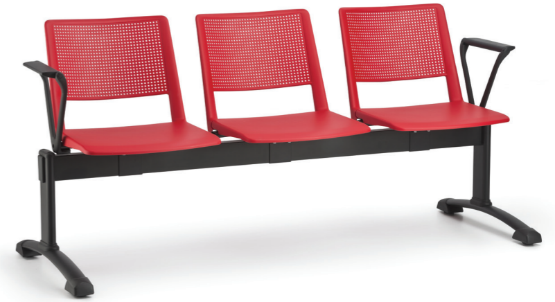
FREE COMMUNITY CHAIR