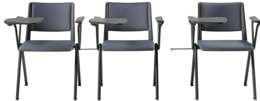
FREE COMMUNITY CHAIR