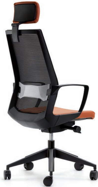
DUKE EXECUTIVE CHAIR