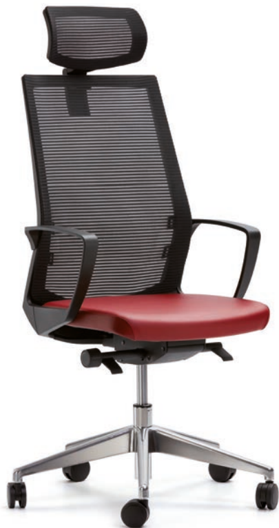
DUKE EXECUTIVE CHAIR