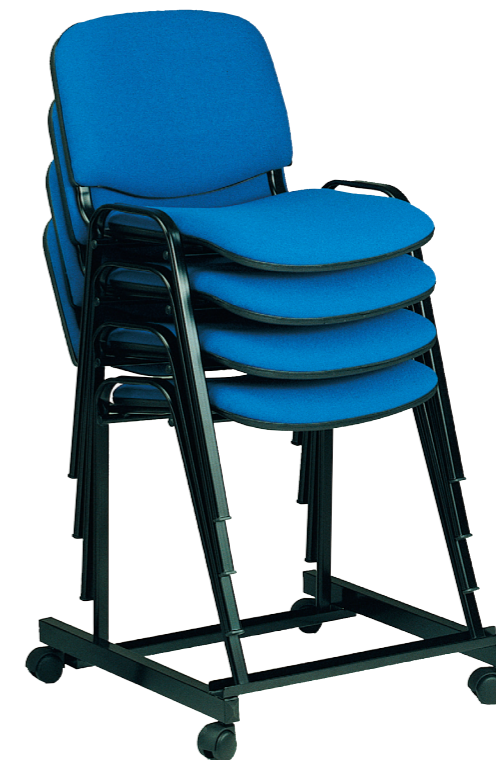
6000 COMMUNITY CHAIR