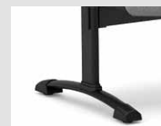
Gamba panca con forma a "T" T-shaped legs