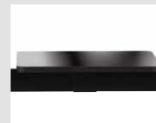
Tavolino Small table