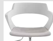
Pannellino imbottito Upholstery seat panel